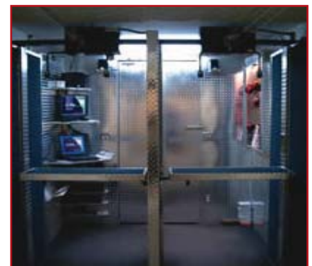
QuickRange with PRISim LiveFire Trainer

* Subject to change based on backlog. Special orders and designs are subject to longer lead times.