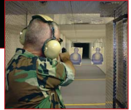
Live Fire Marksmanship