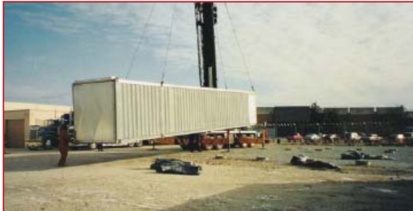
QuickRange container being installed on site