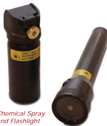
Chemical Spray and Flashlight