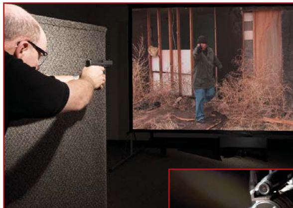
PRISim with optional Integrated ShootBack Cannon

Train to win with PRISim Portable Trainer.