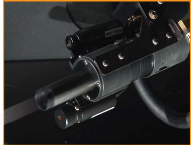
Integrated ShootBack Cannon