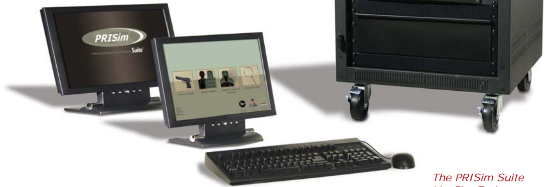
The PRISim Suite LiveFire Trainer

PRISim Suite LiveFire Trainer is available for installation into certified live fire ranges or our self-contained modular QuickRange®.