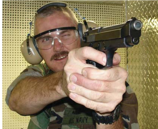
Live Fire Qualification