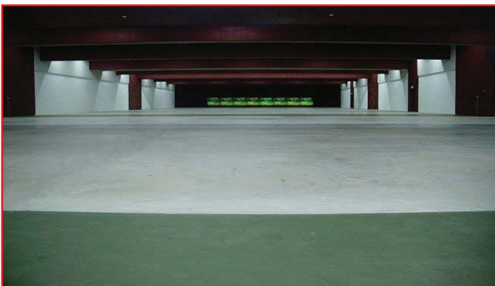
100-metre indoor range with live-fire simulation